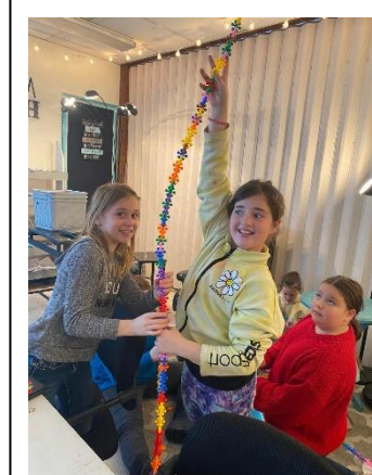
Apollo 4 th grade students complete STEM kit challenges