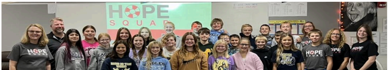
2023-2024 MCJH Hope Squad

Thank you in advance for helping make a difference in the lives of our students and community.