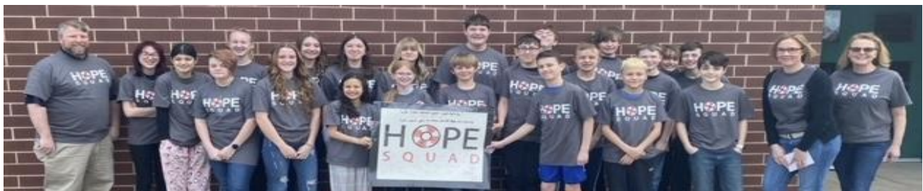
2022-2023 MCJH Hope Squad